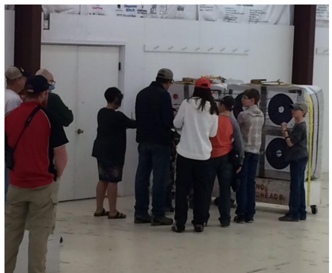
Right: Scoring the kids targets at Sunday WSAA shoot.